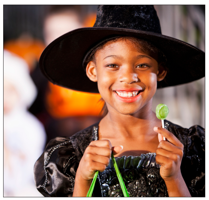
The girls at Clymer had the unique experience this year of designing their Halloween costumes with designer fabric. Thanks to a generous donation, staff were able to help them create the costumes of their dreams.