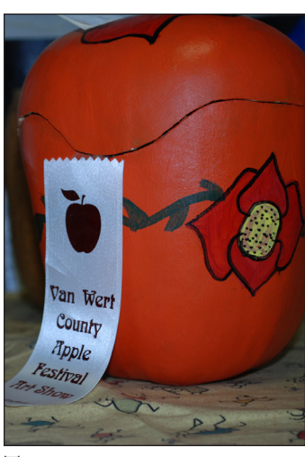
This year's projects were painted gourds.