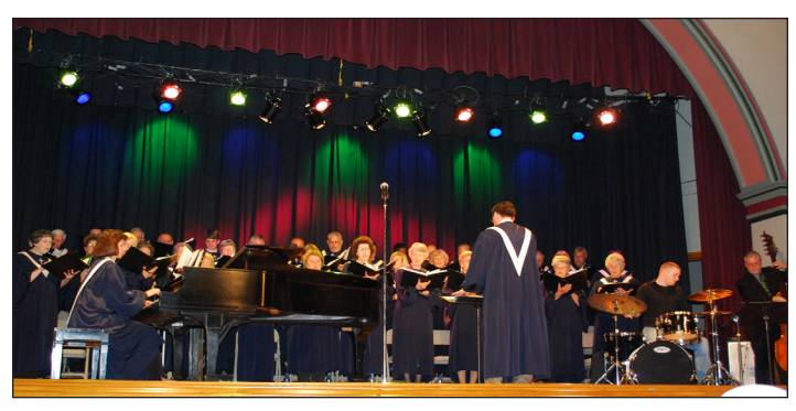
The First United Methodist Choir performed at The Marsh Foundation in March as part of the Living the Legacy program.