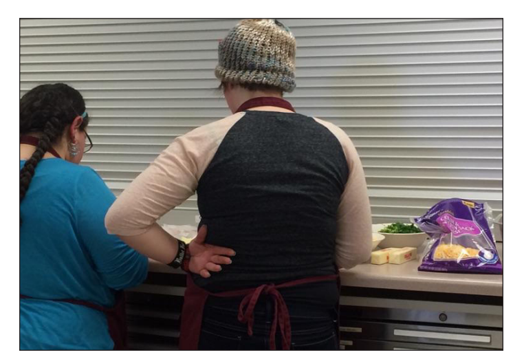
Staff and youth completed various service projects during this year's spring break; including serving the weekly Bread & Bowl meal at First United Methodist Church.

projects were in an effort to make the youth more aware of issues such as homelessness and hunger. Service is a strong component of The Marsh program