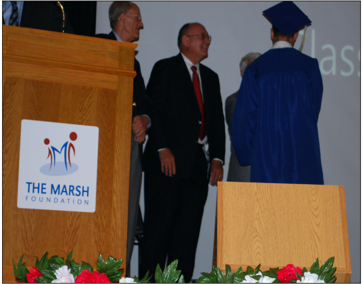
The Spring Celebration and Graduation Ceremony at The Marsh, honored 10 graduates that received their high school diploma. There was a musical production, piano recital, awards presentation as well as a luncheon.