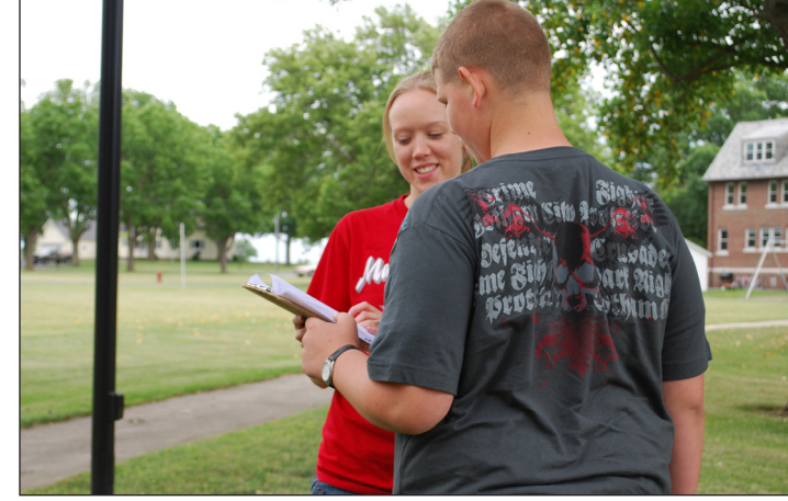
Now that it is summer, a lot of time is spent outdoors.

All youth in the house are responsible for their own set of