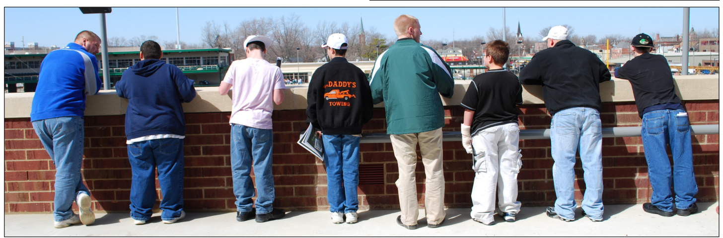
Clockwise starting at top right: A Vance Hall youth participates in the on campus talent show, how many ways can you eat a pizza? A Marsh Hall youth participates in the talent show. Marsh Hall had the opportunity to tour Parkview Field in Fort Wayne before its grand opening this spring. Youth and a volunteer spend time together fishing at the last Supper Club meeting of the year. During spring break, youth had the opportunity to spend a day at Woodhaven Program Center in Lima. One of the activities they participated in was conquering a ropes course by working as a team, exerting confidence and trusting their team members.