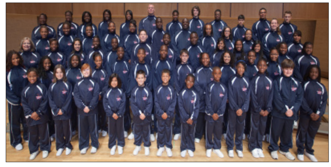
The Voices of Unity Youth Choir from Ft. Wayne, Ind., will perform at The Marsh Auditorium on Saturday, April 2 at 7 p.m. Concert admission is free with the donation of perishable food items for local food pantries.

On Wednesday, March 23, there will be a guest panel in the auditorium. Guests will have an opportunity to share their experiences relating to homelessness and/or hunger and the youth will have a chance to ask questions and to learn from their stories. A video presentation will