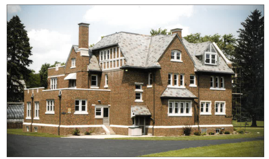
The Marsh is currently in search of live-in staff for Senior Hall.

The person would have 48 hours of time off per week and manage the scheduling and day-to-day operations of the home. Someone that has experience working in a behavioral setting with youth is preferred. An excellent pay and benefit package is provided. For more information, call 419.238.1695 ext. 340.