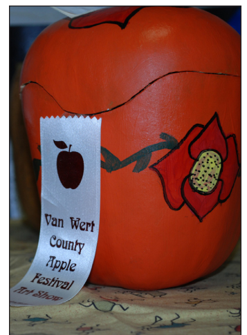
This year's projects were painted gourds.