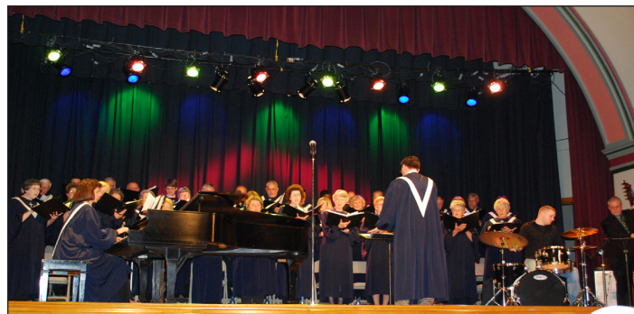
The First United Methodist Choir performed at The Marsh Foundation in March as part of the Living the Legacy program.