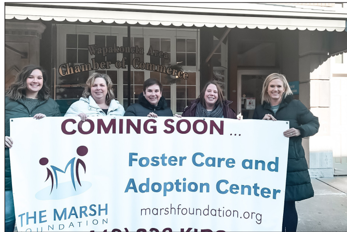
The Marsh Foundation Foster Care and Adoption staff pose in front of the Wapakoneta Chamber of Commerce, the location of their newest office.