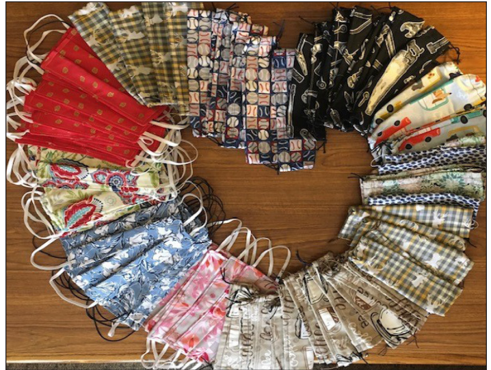
Pictured are some of the masks donated to The Marsh Foundation by community members.