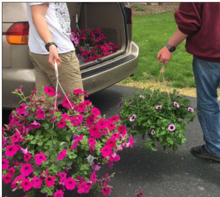
Youth in the Marsh Grown garden program held their annual spring plant sale this May.

The independent living group students held the 8th annual spring plant sale May 11 selling hanging baskets. This is a good kick start to the summer garden program that aims to teach job skills to independent living youth that apply for the campus garden job.