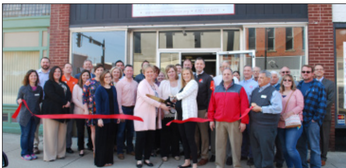
One year ago, The Marsh opened their Foster Care and Adoption Center on Main Street in downtown Van Wert.