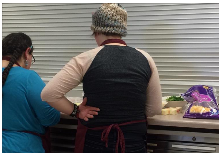
Staff and youth completed various service projects during this year’s spring break; including serving the weekly Bread & Bowl meal at First United Methodist Church.

projects were in an effort to make the youth more aware of issues such as homelessness and hunger. Service is a strong component of The Marsh program