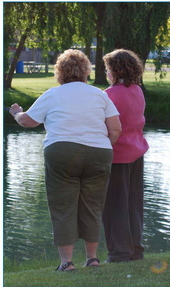
Above: A youth, and her mentor spend time fishing and talking at the final Supper Club of the year.