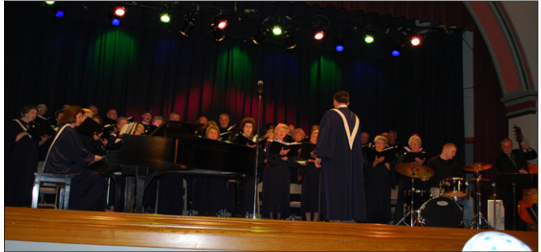
The First United Methodist Senior Choir recently performed a variety of gospel and well-known songs in The Marsh auditorium. The performance was part of the Living the Legacy event.