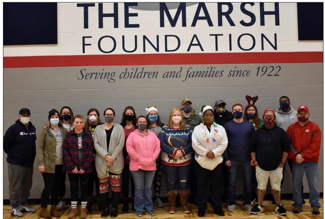
The Marsh Foundation has its own group of essential worker heroes.

Not only are staff present, and shifts are covered, but they have also done much more. "During the pandemic, the staff have gone above and beyond to keep our youth safe," Truxell continued. "They use all safety precautions during family visits, work extra hours as needed and are cognizant of their actions and where they go outside of work." This dedication has not gone unnoticed and is appreciated immensely.