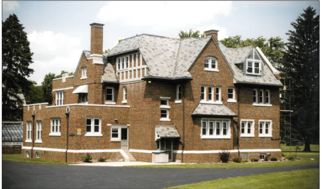
The Marsh is currently in search of live-in staff for Senior Hall.

The person would have 48 hours of time off per week and manage the scheduling and day-to-day operations of the home. Someone that has experience working in a behavioral setting with youth is preferred. An excellent pay and benefit package is provided. For more information, call 419.238.1695 ext. 340.