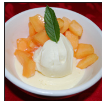
Delicious fresh melon and custard was served for dessert.

The Independent Living garden crew finished the summer on a strong note. They prepared and served an impressive meal to staff and trustees. The meal used things grown in their garden and other locally obtained produce and food products. The youth learned the value of growing their own food and the health benefits to using food products found close to home.